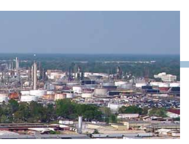
The ExxonMobil oil refinery in Baton Rouge, Louisiana, the second-largest in the United States.

significant reduction in OPEC output will have an almost insignificant impact on their revenues. OPEC's exports, which today amount to around 21 million barrels per day, are worth a little less than $600 billion at $75 per barrel. A reduction in exports of 10 percent that raises prices to $90 might boost revenues 3 percent or 4 percent at best. In short, OPEC has lost its leverage over the oil market.