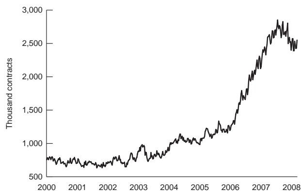
Figure 3 Open Interest in Three Primary Crude Futures Contracts