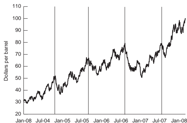
Figure 2 Oil Price Cycles, 2004 to 2008: Daily Dated Brent Price With Traditional Fall Peaks Noted