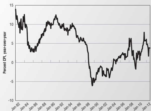
Figure 1 Hong Kong CPI Inflation

Canadian dollar, the Singapore dollar, the Australian dollar, the New Zealand dollar, the Swiss franc, the Norwegian krone, and the Swedish krona. But the inclusion of small currencies that are not used for global invoicing and have only weak trade links with Hong Kong makes little sense. That leaves the U.S. dollar, the euro, and the Japanese yen as realistic candidates. With the U.S. dollar still a dominant currency in Hong Kong's economic life, pegging the Hong Kong dollar to such a narrow currency basket would make little difference to pegging it against the U.S. dollar.