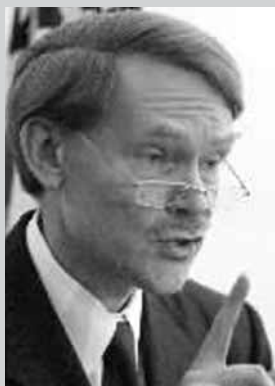
U.S. Trade Representative Robert Zoellick