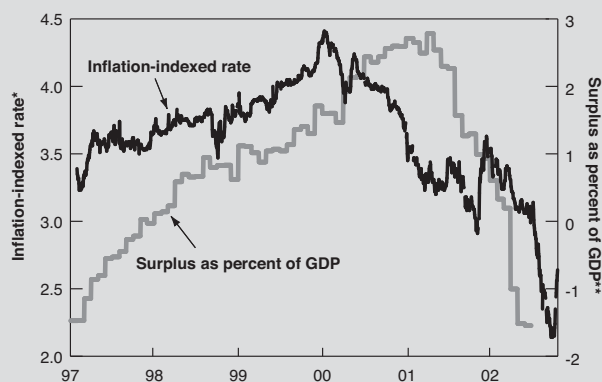
Figure 2 Real Ten-Year Treasury Interest Rate and the Unified Surplus, Percent