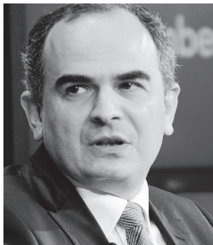
Turkey's central bank governor Erdem Basci .

in the early 1990s through a prudent combination of fiscal and monetary policy.