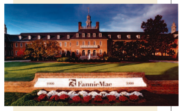
Fannie Mae headquarters in Washington, D.C.