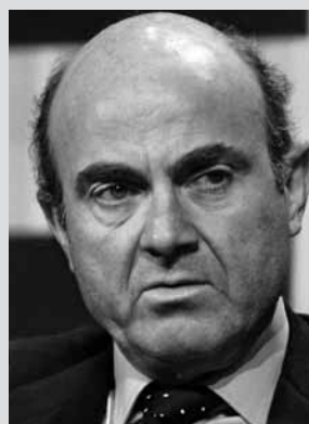
Luis de Guindos